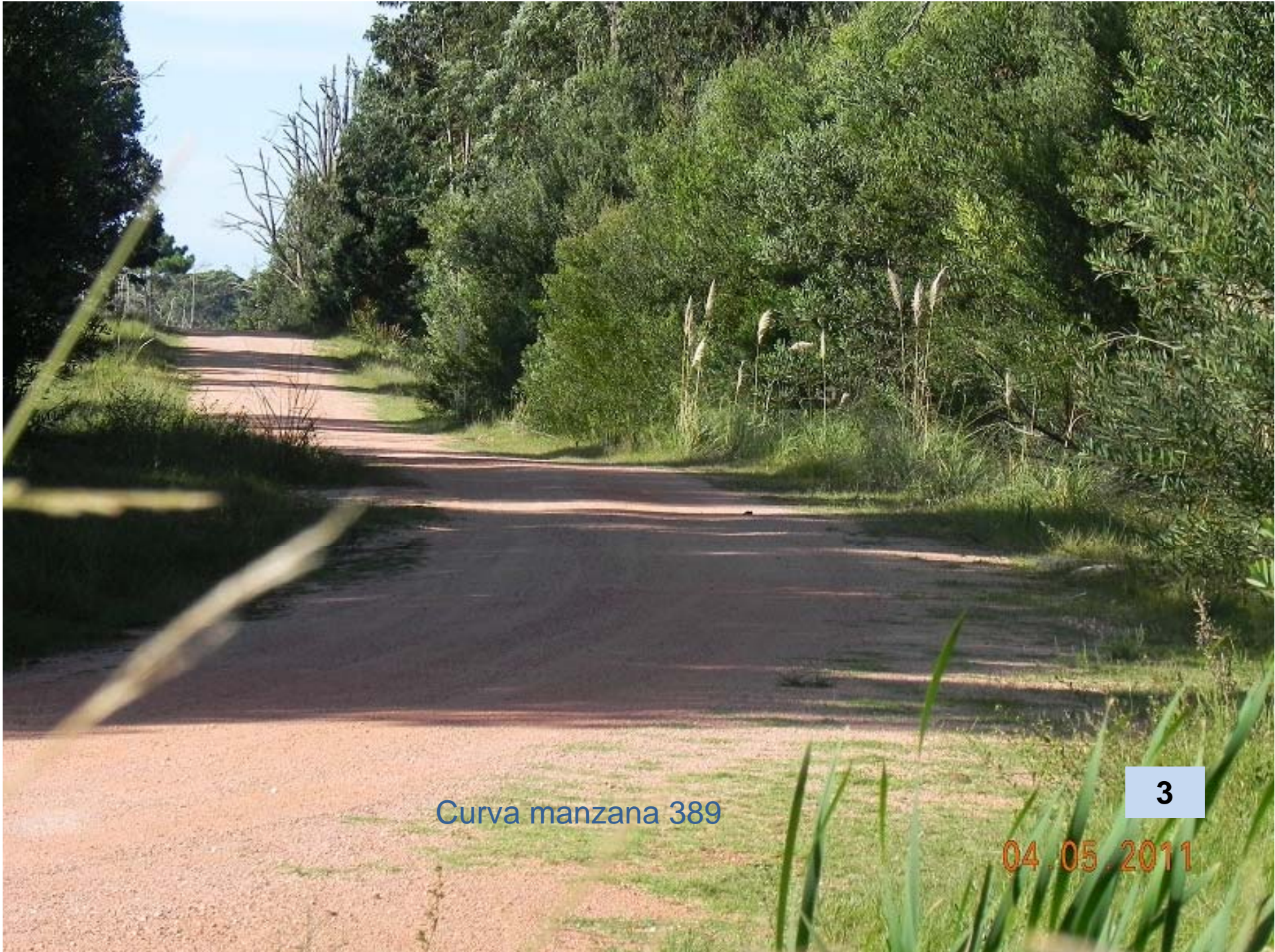
Curva manzana 389