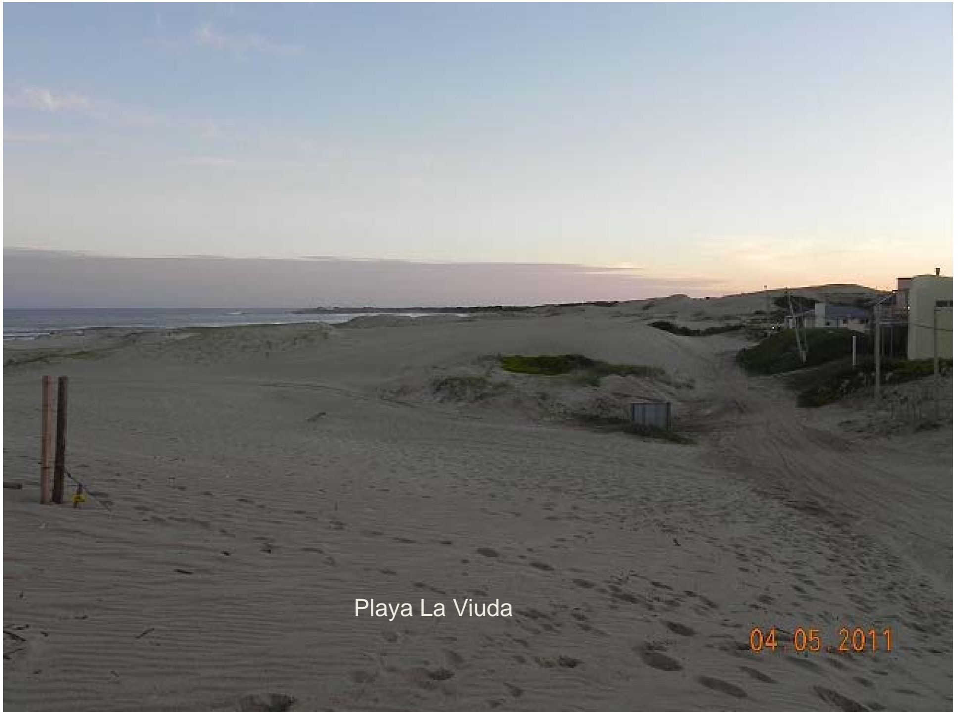
Playa La Viuda